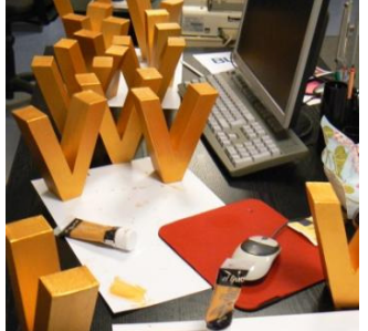
VITA trophies' production